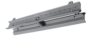
Double Flex-Clip XL, top, P-306 special, double sided fixing

Add as many systems as needed. No limits in total length or width.